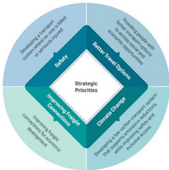
Figure 1: Strategic priorities for land transport